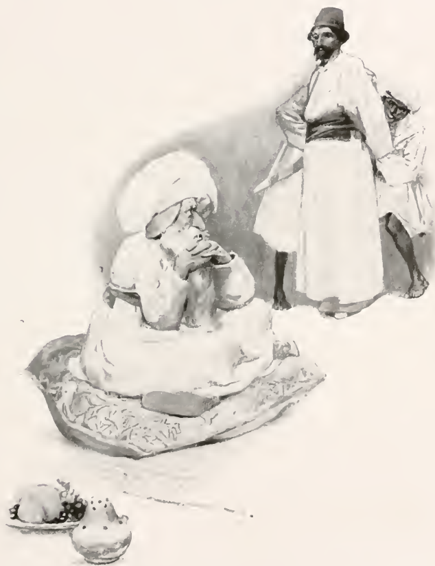
On one of the cushions sat a little old man (P. 32.)

The little man raised himself in wrath and attempted to box the ears of the man who had annoyed him by this speech, but as he could not